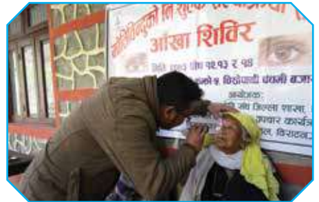
Pic: Surgical eye camp at Ilam