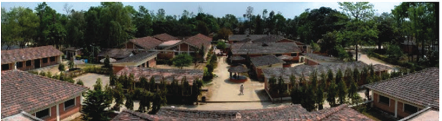
Sagarmatha Choudhary Eye Hospital, Lahan-3, Siraha Email: sceh@erec-p.org || Phone No.: 00977-33-560402