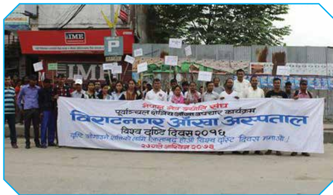
World Sight Day