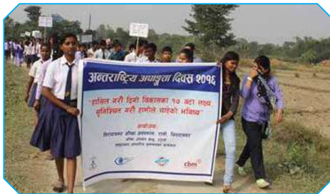
World Disability Day