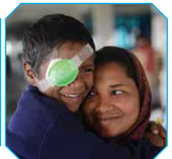
Story & Picture: Ashok Shah, CBM-Nepal