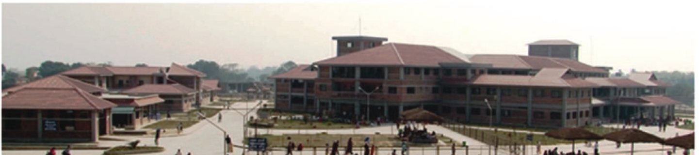
Biratnagar Eye Hospital, Rani, Biratnagar-17, Morang Email: beh@erec-p.org || Phone No.: 00977-21-436358